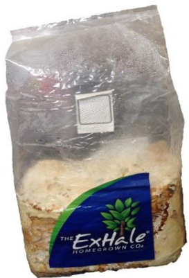
TESTS 1 & 2